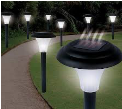
SOLAR GARDEN LAMP