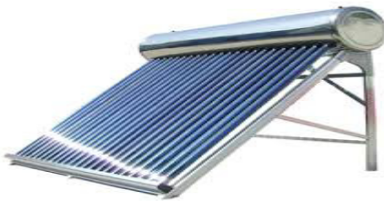
SOLAR WATER HEATER