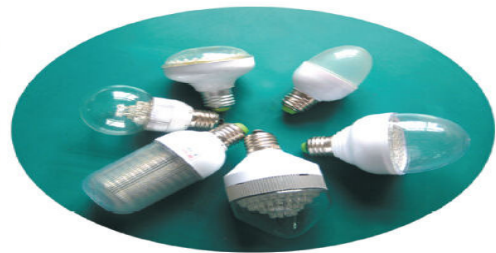
SOLAR DC (BULB, CFL, LED)