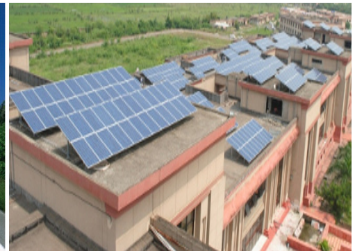
SOLAR POWER PLANT