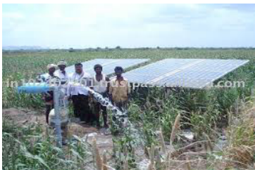
SOLAR WATER PUMP